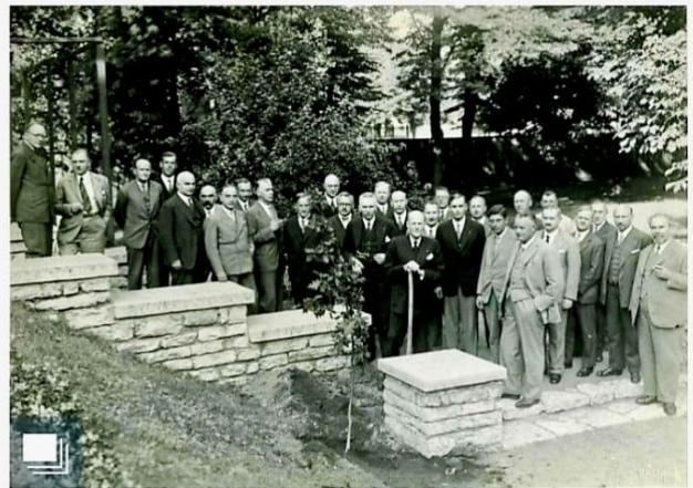
Paul Harris and members of the Rotary Club of Tallinn, Estonia, at a tree planting in 1932.